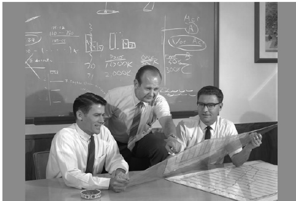
Figure 8: Frequency of student/instructor interaction distributed by Institution